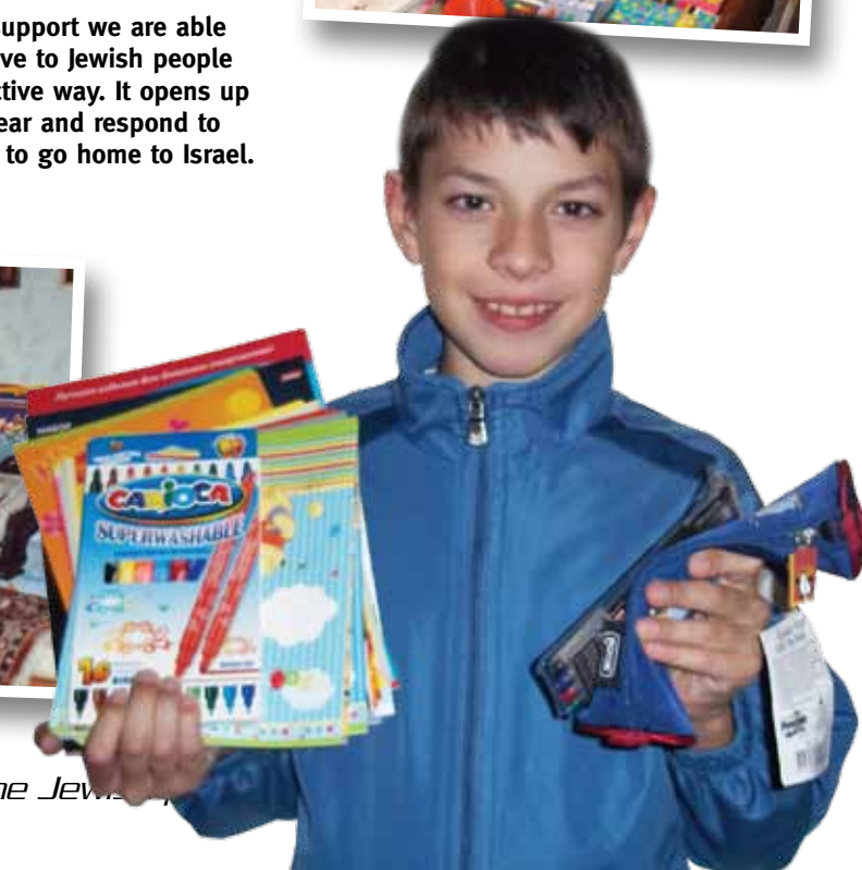
A Christian ministry helping the Jewish people...