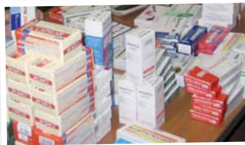
Medicines ready for delivery to Holocaust survivors.

Operation Exodus is an instrument of the Lord, to encourage and help the Jewish people to return to the Land of Israel from the land of the north and all the nations and to proclaim God’s Kingdom purposes for their return.